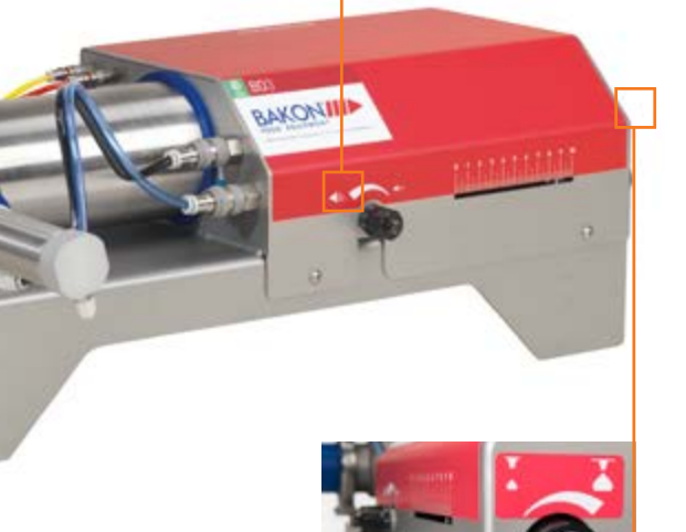
Dosing volume | The dosing volume is manually set and indicated on the scale