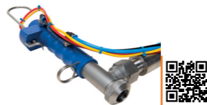
Handgun with hose